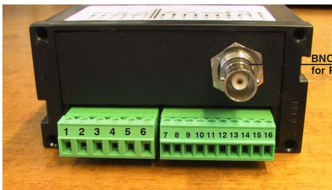
"BNC" connector for Redox probe